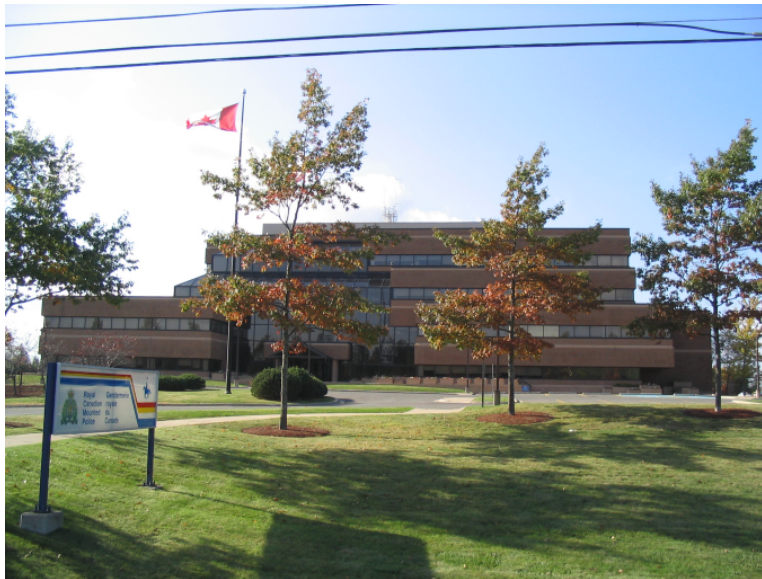
RCMP New Brunswick "J" Division Headquarters

However, with respect to the allegations concerning the actions of a retired member of the RCMP, this investigation is ongoing and, as such, it would be inappropriate for me to comment further at this time.”