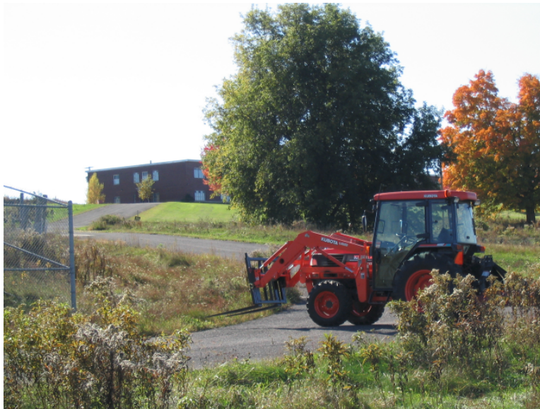
Kingsclear School access road blocked on day of Press Conference with Peter Goldring

Nobody believes that an investigation, supposedly under way, in one form or another, for 20 years, could come to no clear conclusions and result in no